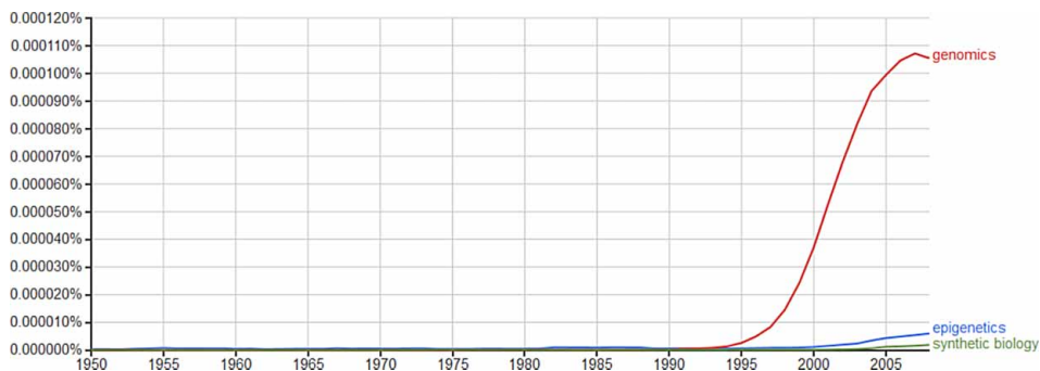
Figure 2. Genomics, synthetic biology and epigenetics on Google Ngram viewer (Google books).